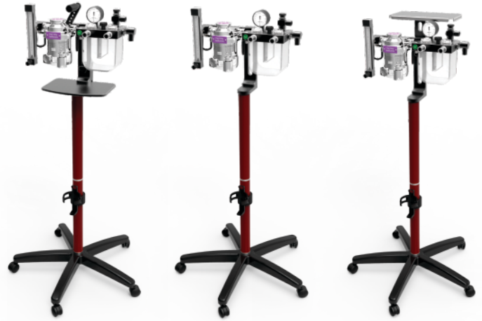
VAM-510QS* Quick Stand Mount